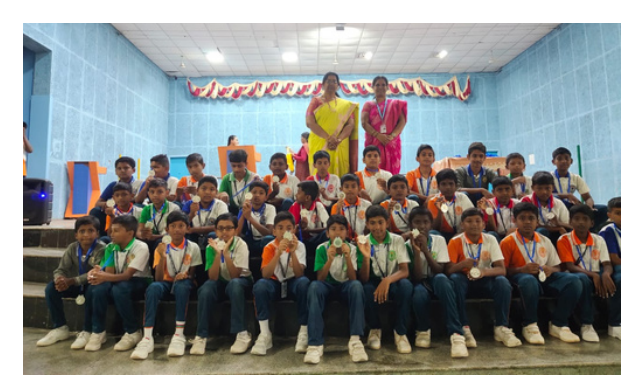
SCOUTS 2ND PLACE