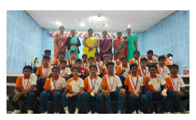
MERCURY GROUP BOYS-3RD PLACE