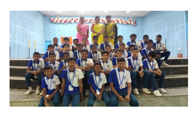
VENUS GROUP (BOYS) -2ND PLACE