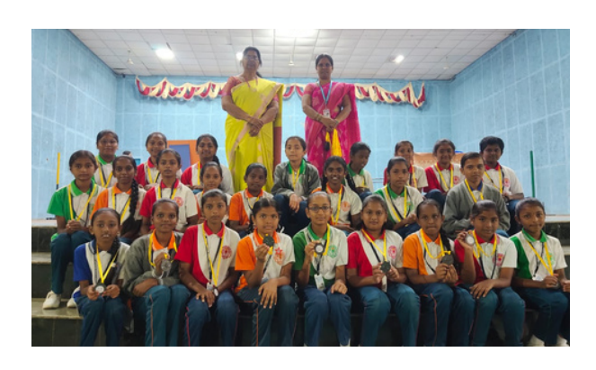
GUIDES 3RD PLACE