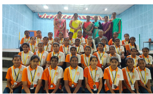
MERCURY GROUP GIRLS-3RD PLACE