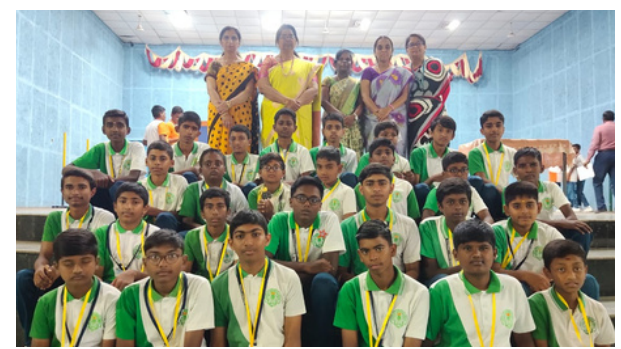
JUPITER GROUP(BOYS) -3RD PLACE